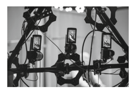
Fig. 1. Panasonic cameras used to capture multiple views of the interview.

continuous takes recorded on 512 GB flash drives. In practice, this was not a problem, as it provided natural breaks in the interview. Scene illumination was provided by a LED-dome with smooth white light over the upper-hemisphere (Fig. 2). This is a flattering neutral lighting environment that also avoids hard shadows.