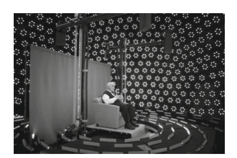
Fig. 2. Survivor in the lighting environment.

A key feature of natural conversation is eye-contact, as it helps communicate attention and subtle emotional cues. Ideally, future viewers will feel that the storyteller is addressing them directly. This could best be achieved if the survivor would maintain eye contact with the central stereo RED cameras. To create such eye contact, we placed the interviewer off to the side, so that their face was visible as a reflection in the stereo mirror box aligned with the central cameras. An opaque curtain, placed on the direct line of sight between the survivor and the interviewer, prevented the survivor from turning towards the interviewer directly.